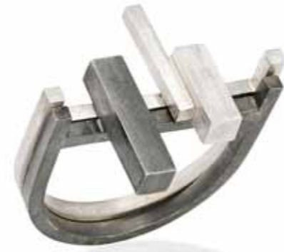
Black Box rings #01 and #02 -silver, oxydised silver