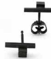
Black Box #02 -Ear studs, oxidised silver