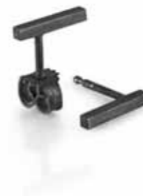
Black Box #04 -Ear studs, oxidised silver