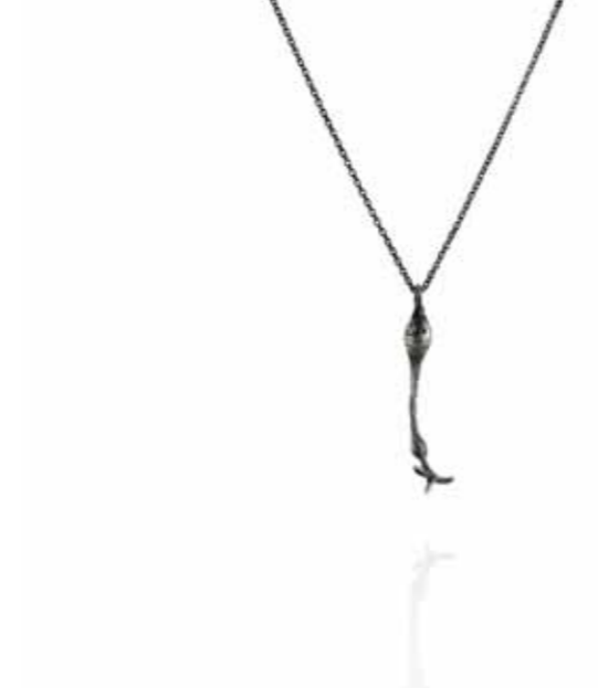
Seaweed small -necklace, oxidised silver