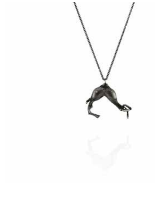
Seaweed large -necklace, oxidised silver