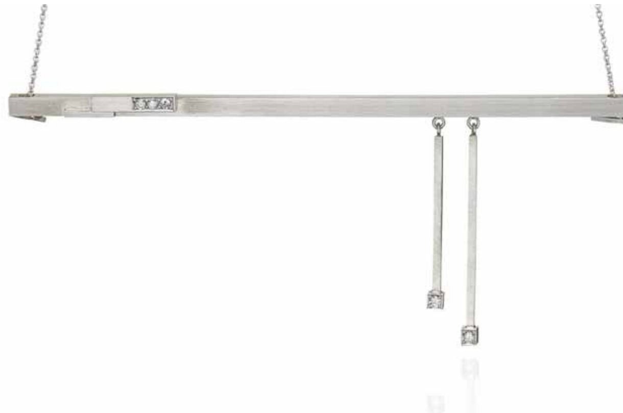
Swing #03 -necklace, silver, 5x0,05ct dia.