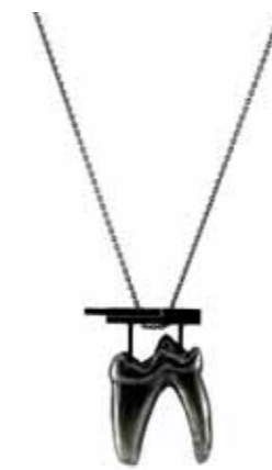
Fang medium #02 -necklace, oxidised silver