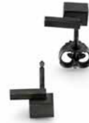
Black Box #01 -Ear studs, oxidised silver