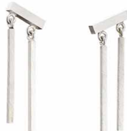
Black Box long -Earrings, silver,