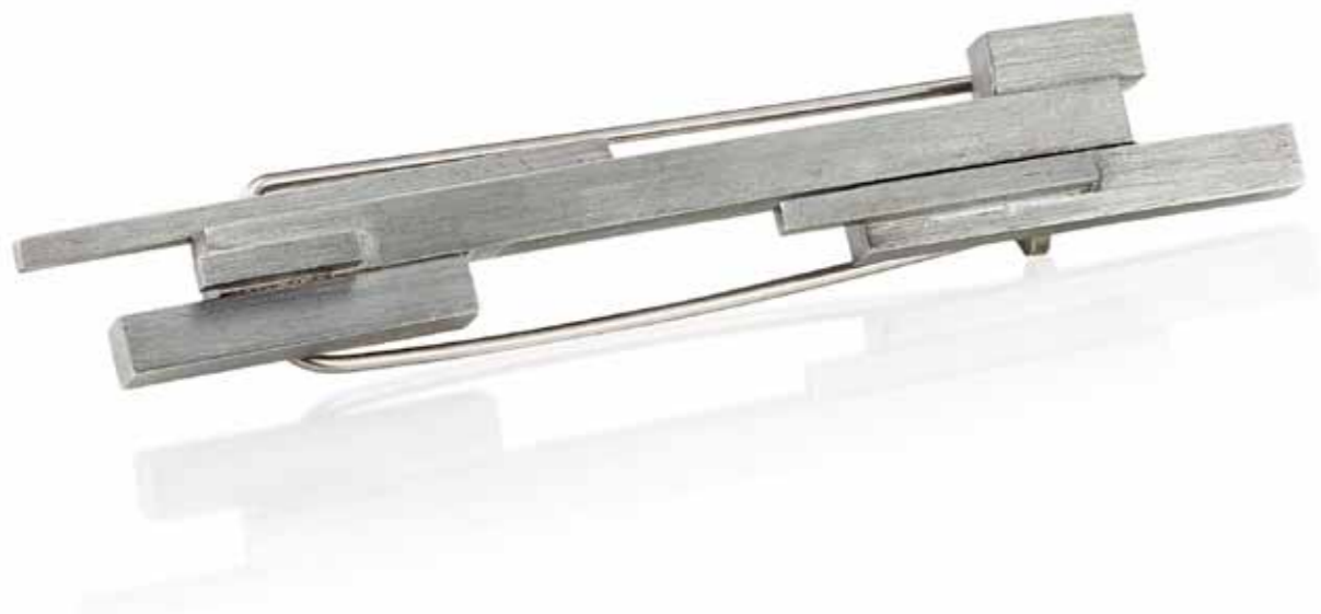
Black Box brooch #01 -oxidised silver