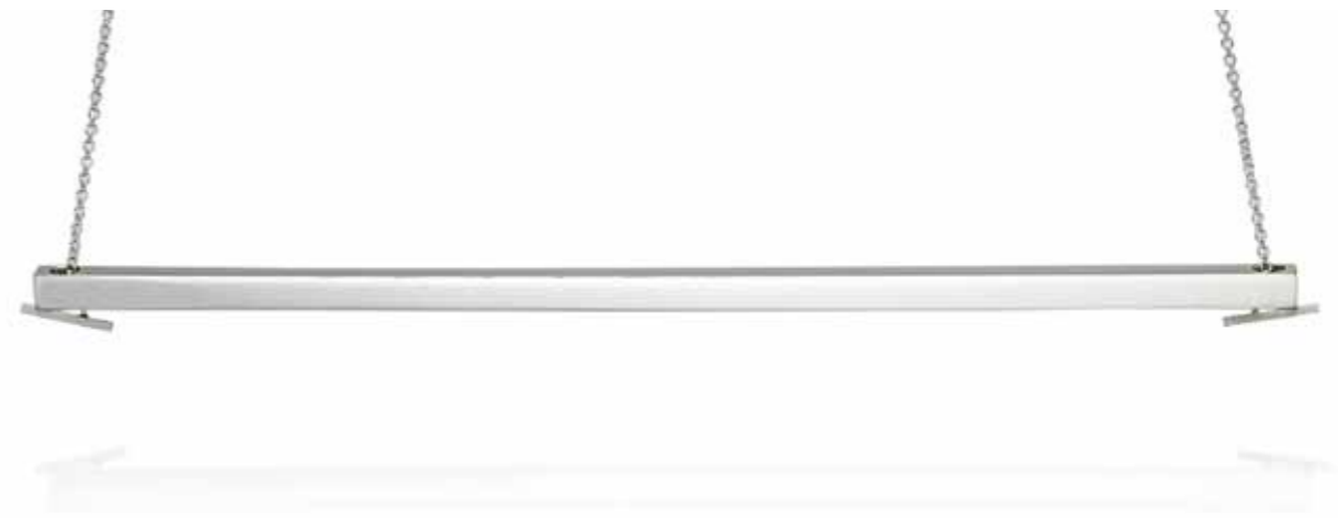
Swing #01 -necklace, silver