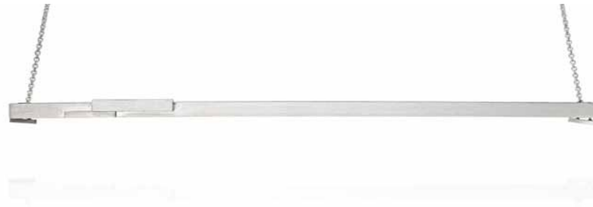
Swing #02 -necklace, silver