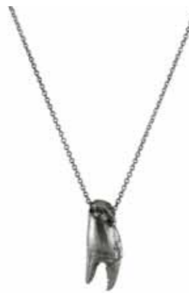
Crab claw -necklace, oxidised silver