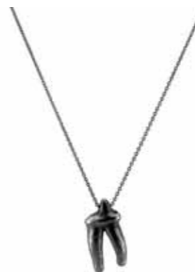
Fang small #03 -necklace, oxidised silver