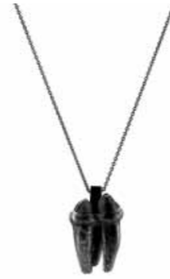
Fang large #01 -necklace, oxidised silver