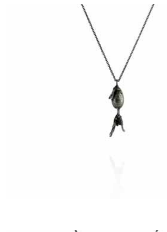
Seaweed medium -necklace, oxidised silver