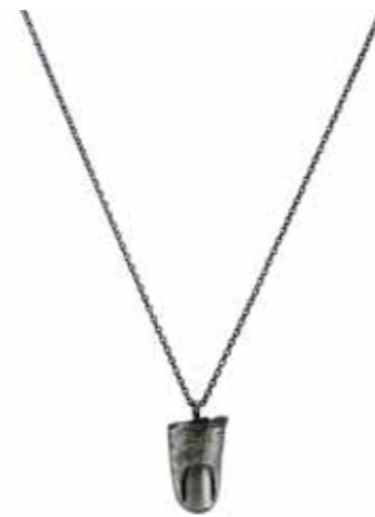
Finger -necklace, oxidised silver