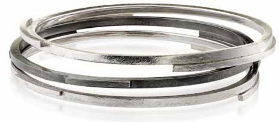
Black Box bracelet -silver, oxydised silver