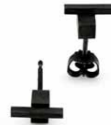
Black Box #03 -Ear studs, oxidised silver