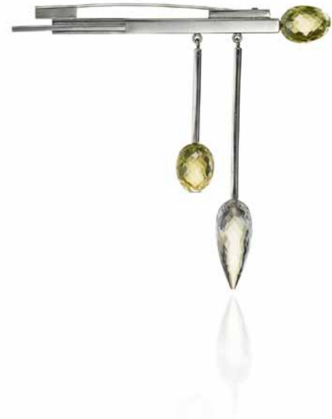
Black Box brooch #02 -black rhodium-plated silver, prasiolite, quartz